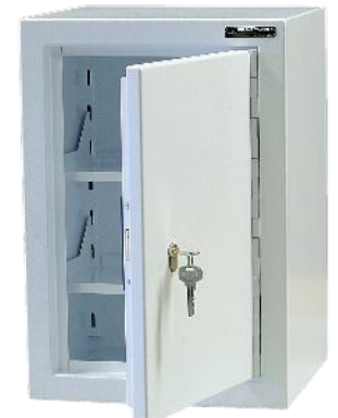
CDC905 (Opt. C)