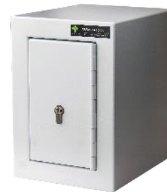
CDC001 (Opt. A)